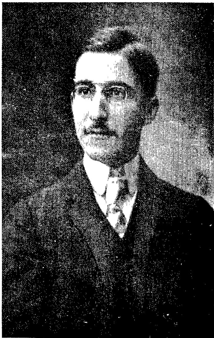
STEFAN ZWEIG AS A YOUNG MAN